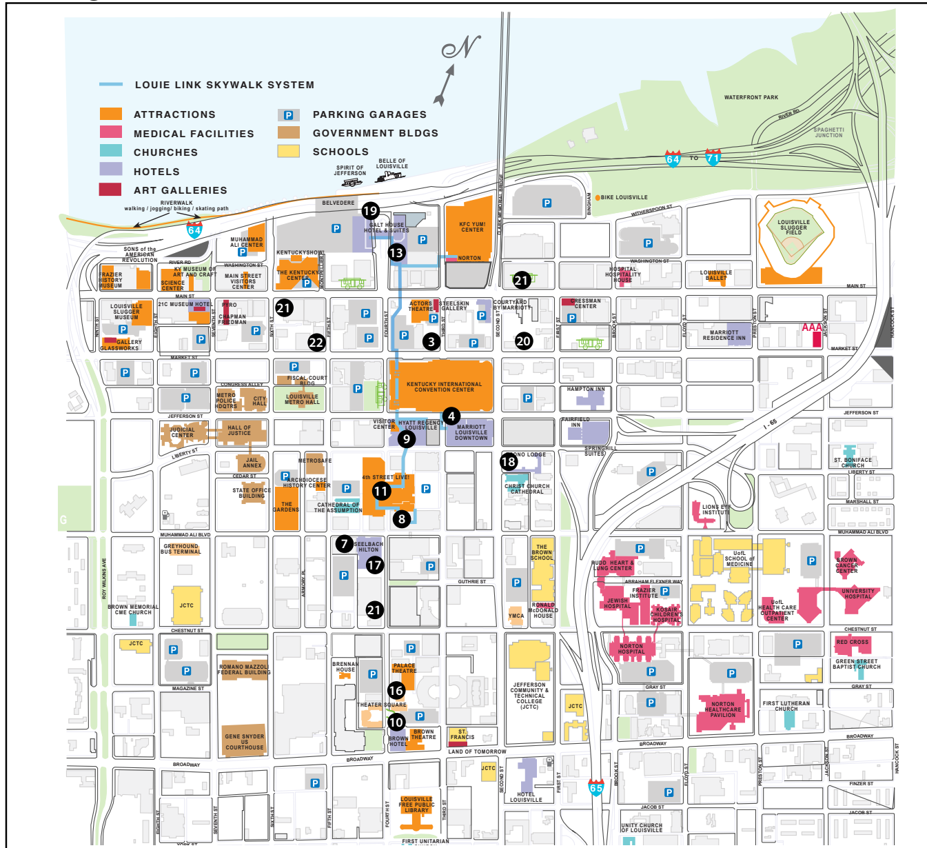
Downtown Map courtesy of Louisville Downtown Management District